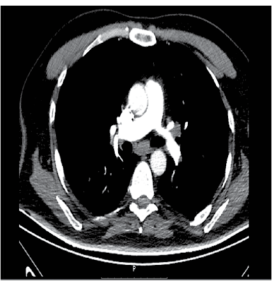
Figure 2. CT angiography scan

lism. In many ICUs, higher doses have been used with the same rationale, confirmed by the data from Klok et al. from 184 patients, in whom most events (81%) were pulmonary embolism [5].